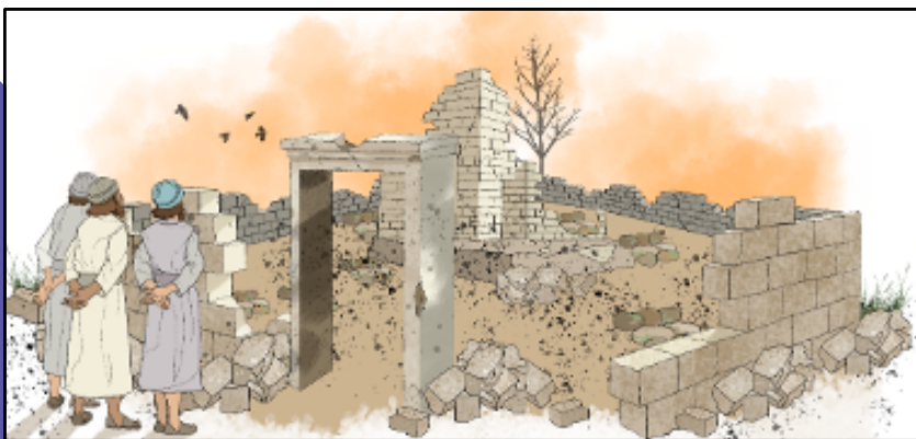
The city of healthcare in ruins: temple, wall, houses – all damaged

Below are some graphics which depict this.