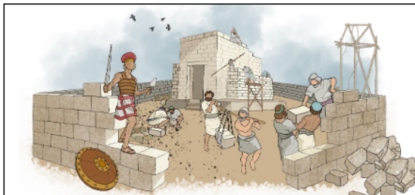
First rebuilding the temple, then rebuilding the walls